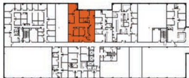
① FLOOR 4 - STE 445 1" = 60'-0"